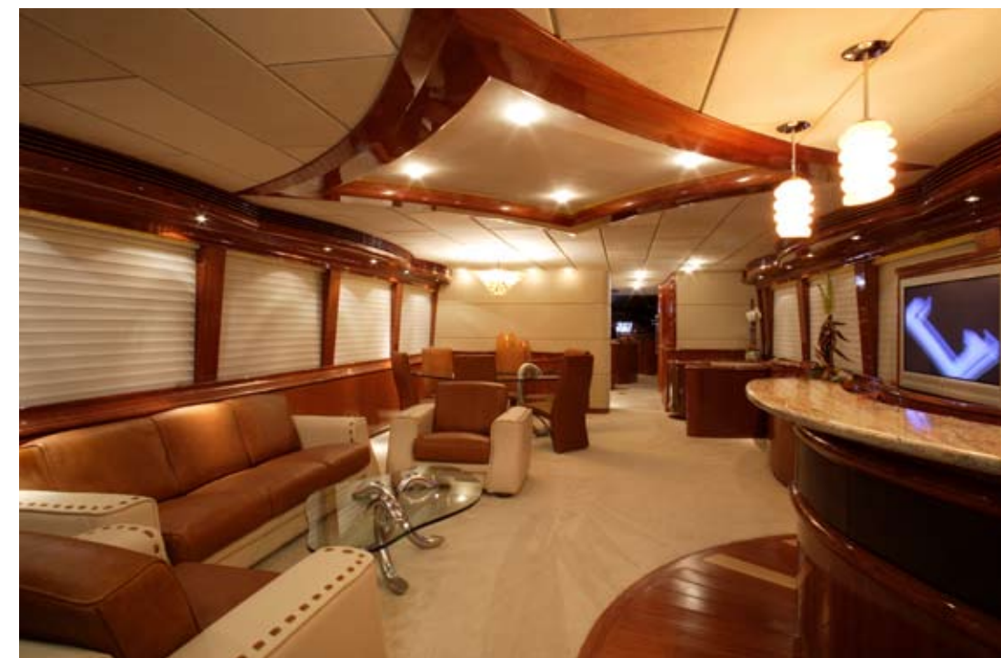
Above: The Hargrave 105' Flushdeck yacht 'Dream' was inspired by an owner with years of boating experience.