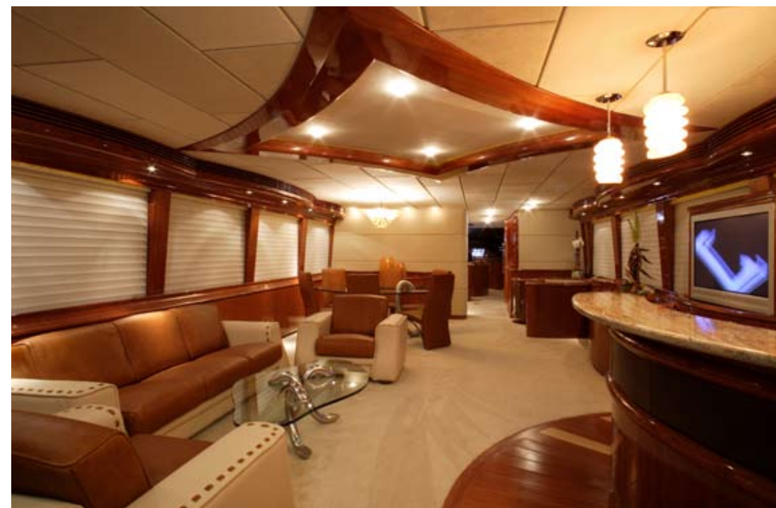
Above: The Hargrave 105' Flushdeck yacht 'Dream' was inspired by an owner with years of boating experience.